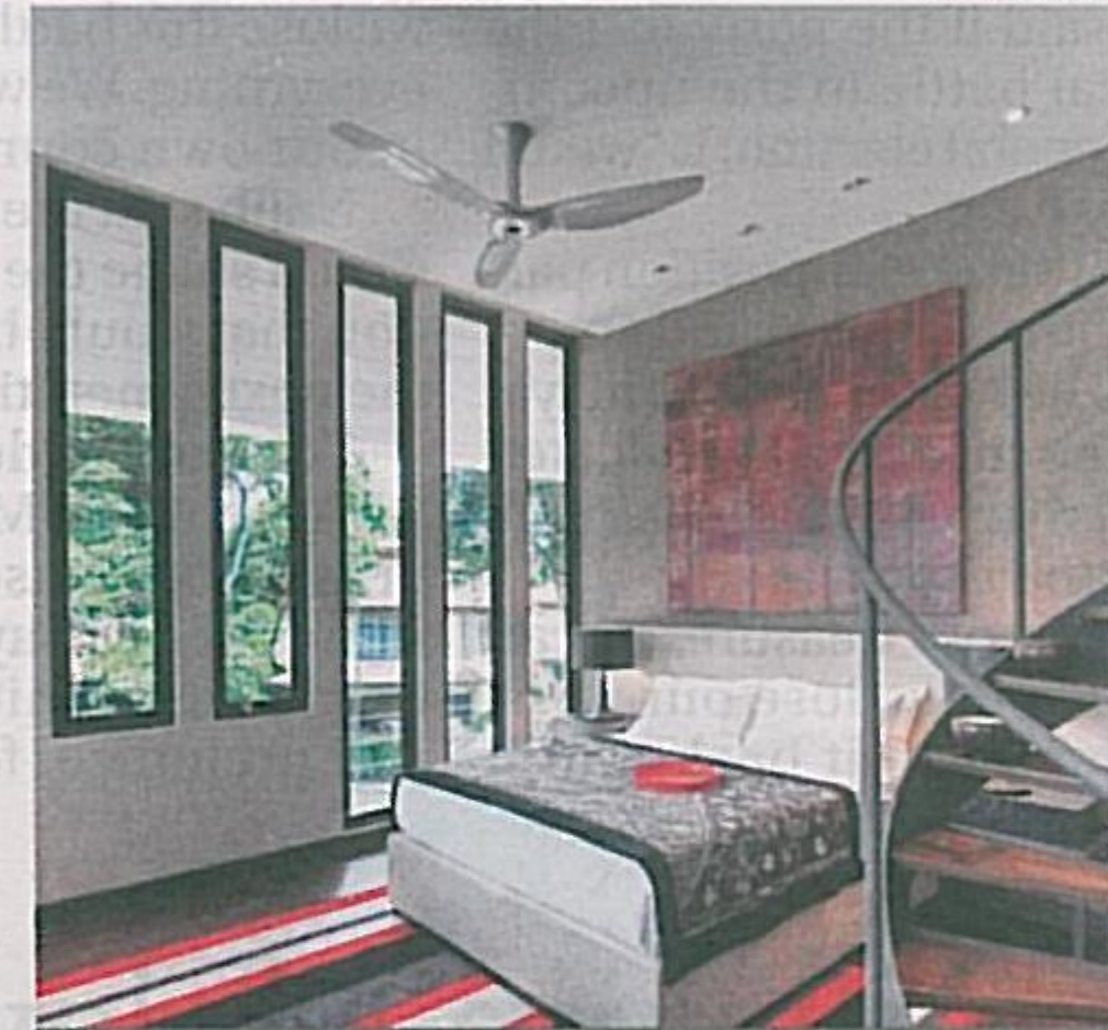
The master bedroom in The Quintet.

has always been an important feature for Gita Bayu and The Quintet is no different. A metal shutter is used to separate the ground floor and first floor where the bedrooms are located while the roof is reinforced concrete with slate tiles.